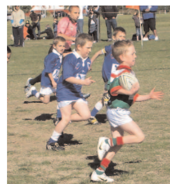
OUR U7 REDS IN ACTION AGAINST THE JETS AT TEMPE OVAL 2011