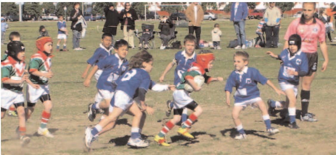
THE 7'S RED'S V THE JETS AT TEMPE OVAL 2011