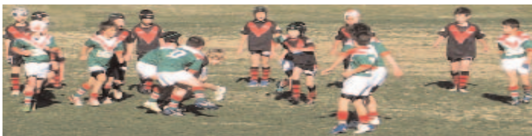
THE UNDER 9 RED'S ON PARADE AT BURROWS